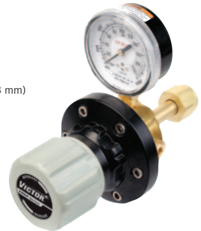
ELC4 FLOW DATA - EDGE Series-Liquid Cylinder